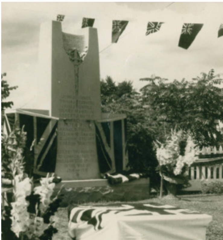
Post WWII Unveiling of the Rockwood Cenotaph

The Cenotaph was subsequently modified to include the names of 13 more men from the Township who fought and died in World War II