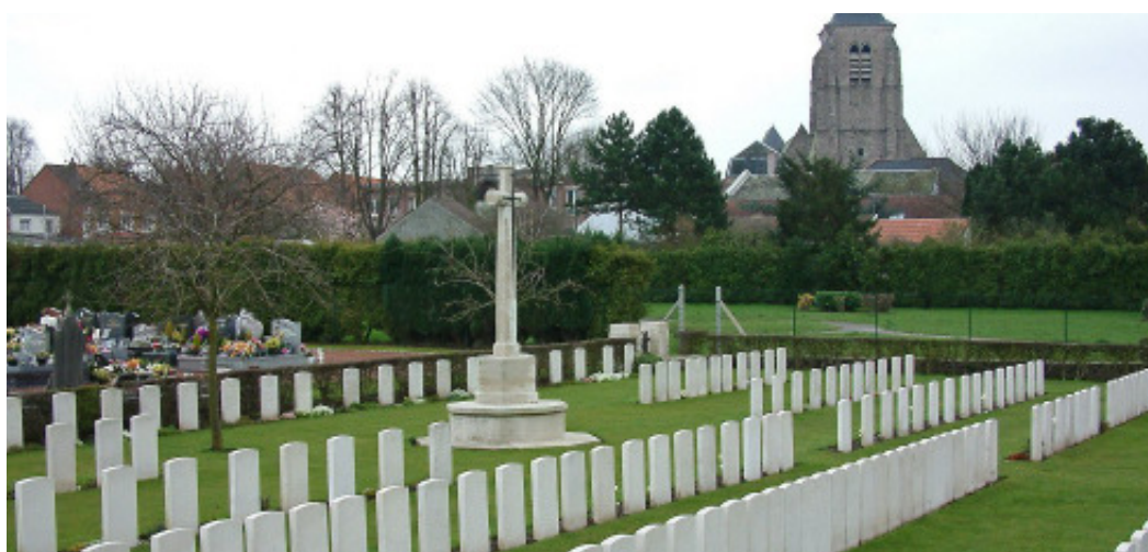
Beuvry Communal Cemetery

Peace Tower of the Canadian Parliament Buildings, Ottawa.