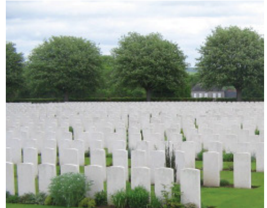
Aubigny Communal Cemetery