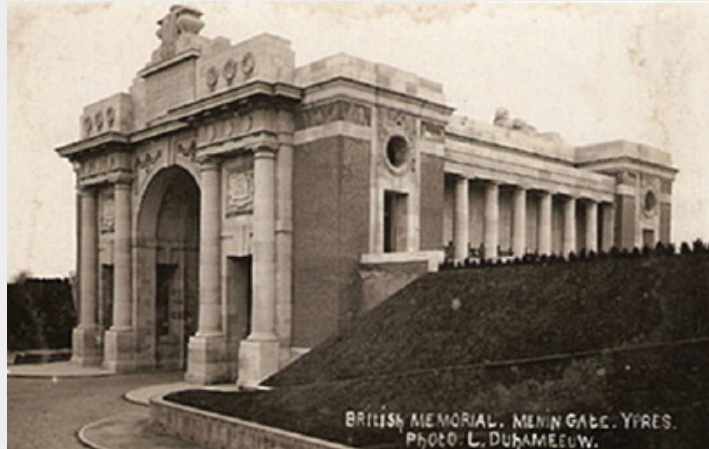
Menin Gate Arch Memorial, Ypres Belgium

TO THE ARMIES OF THE BRITISH EMPIRE WHO STOOD HERE FROM 1914 TO 1918 AND TO THOSE OF THEIR DEAD WHO HAVE NO KNOWN GRAVE.