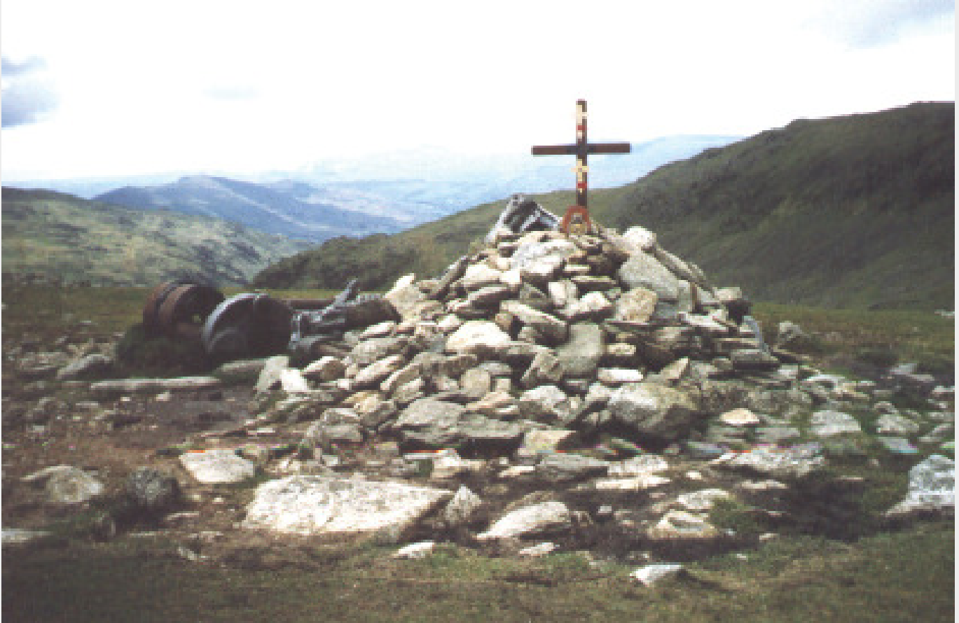
Halifax Crash Site Memorial, Cumbria

A memorial cairn was erected at the crash site to the eight aircrew of Halifax Mk.V, LL505 and it is still surrounded with a large amount of aircraft wreckage. In 2005, Canadian Embassy staff and representatives of the RAF participated in the re-dedication of this memorial. It is the most visited WWII aircraft crash site in Cumbria (formerly Cumberland).