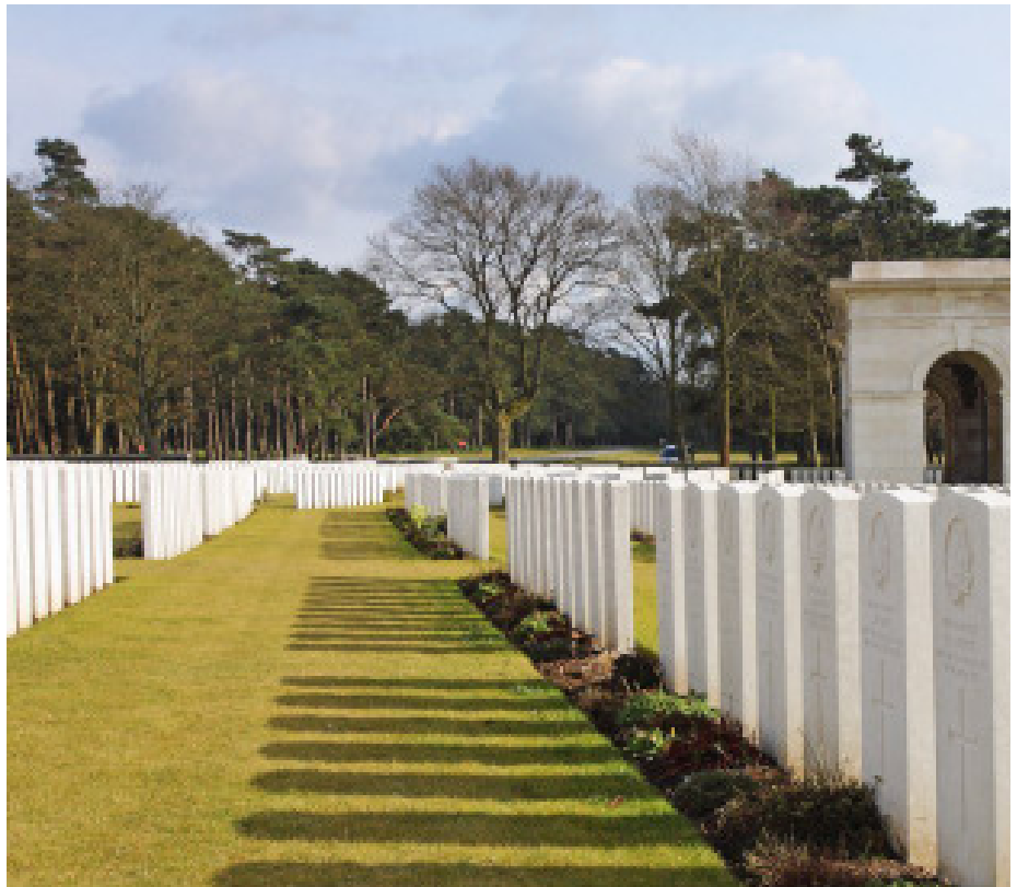
Canadian Cemetery Number 2