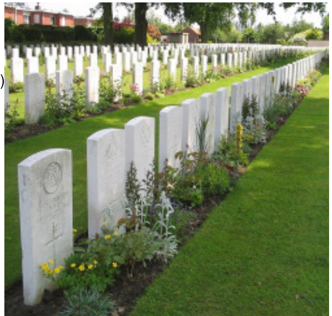
Poperinghe New Military Cemetery Photo

Records of the No. 2 Canadian Field Ambulance main dressing station show Robert Mutrie died on 5 April 1916 of wounds sustained in action during the Battle of the St. Eloi Craters, near the Belgian towns