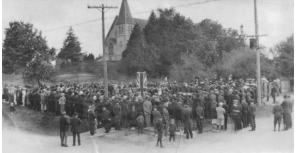
Post WWI Unveiling of the Rockwood Cenotaph

“This is the first monument to be unveiled which has been erected by a municipality.”